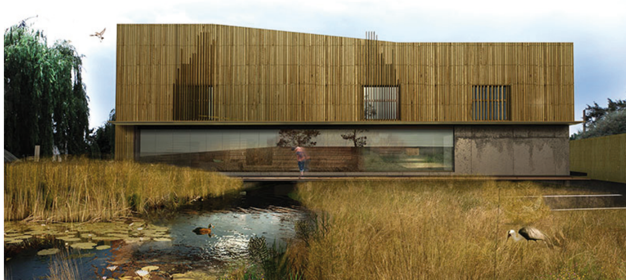
Marc Sherratt Sustainability Architects: Residential units, Johannesburg