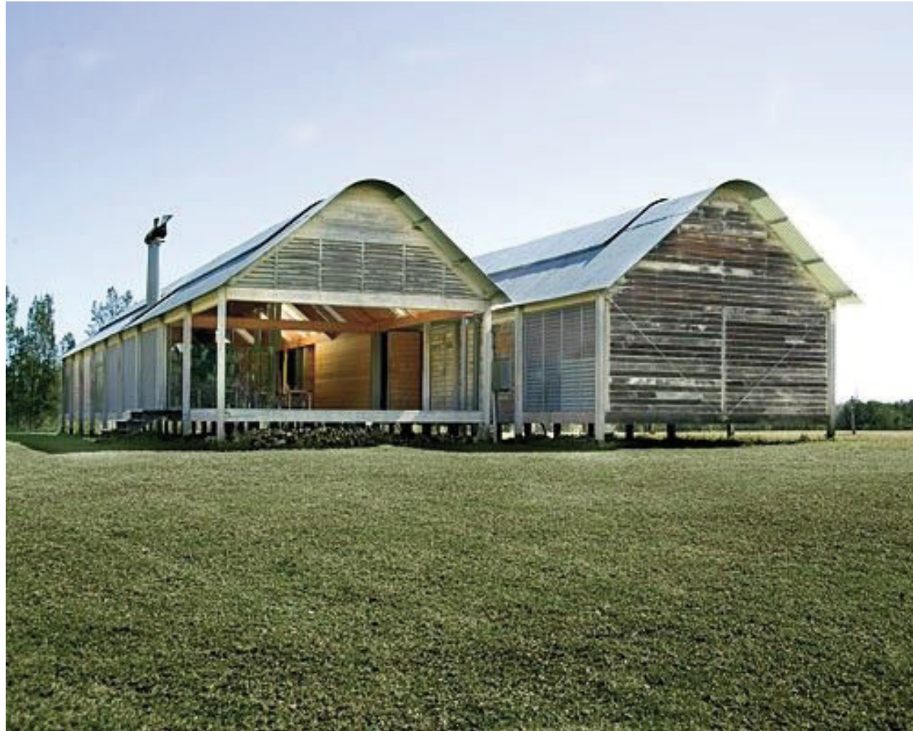
Glenn Murcutt: Marie Short house, New South Wales, Australia