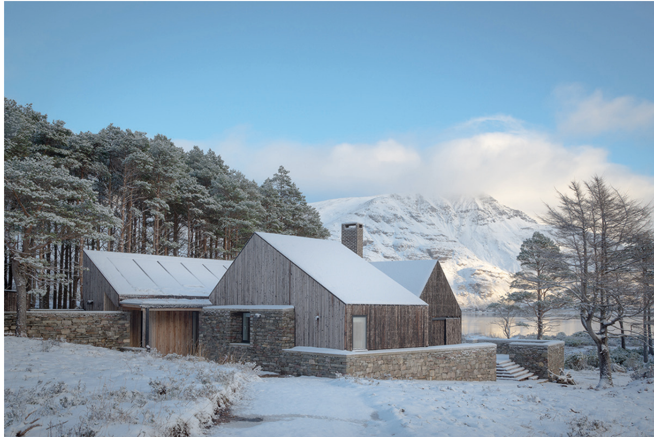
HaysomWardMiller Architects: Lochside House