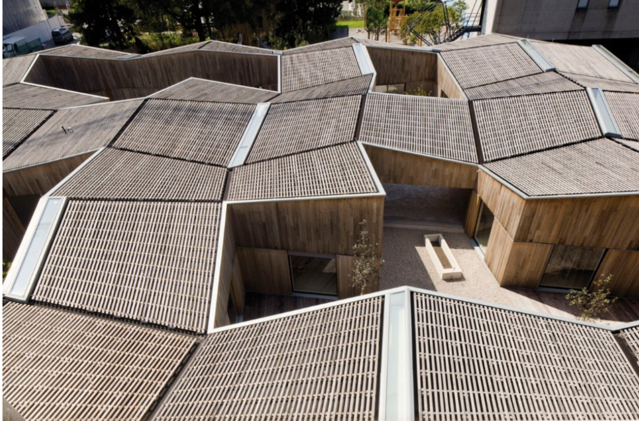
Bruno Fioretti Marquez Architects: Kindergarten, Lugano