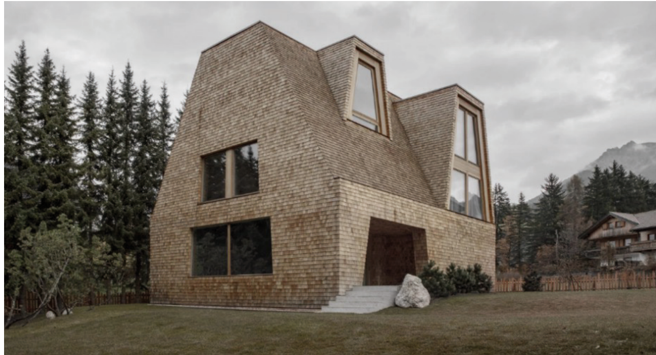
Pedevilla Architects: CiAsa Aqua Bad Cortina house