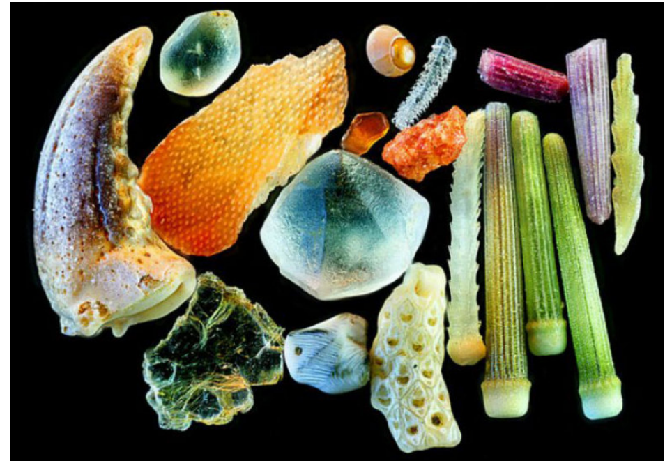
Yanping Wang : Beijing Planetarium: Sand Nikon's Small word, 2010

An architecture which is naturally related to life. This is the common ground of the chosen examples, which results quality at each. This architectural mentality can be also used by designing other type of houses during and after the university studies. The wineries raised their marketing role significantly. Architecture won a new door to contact a much larger audience.