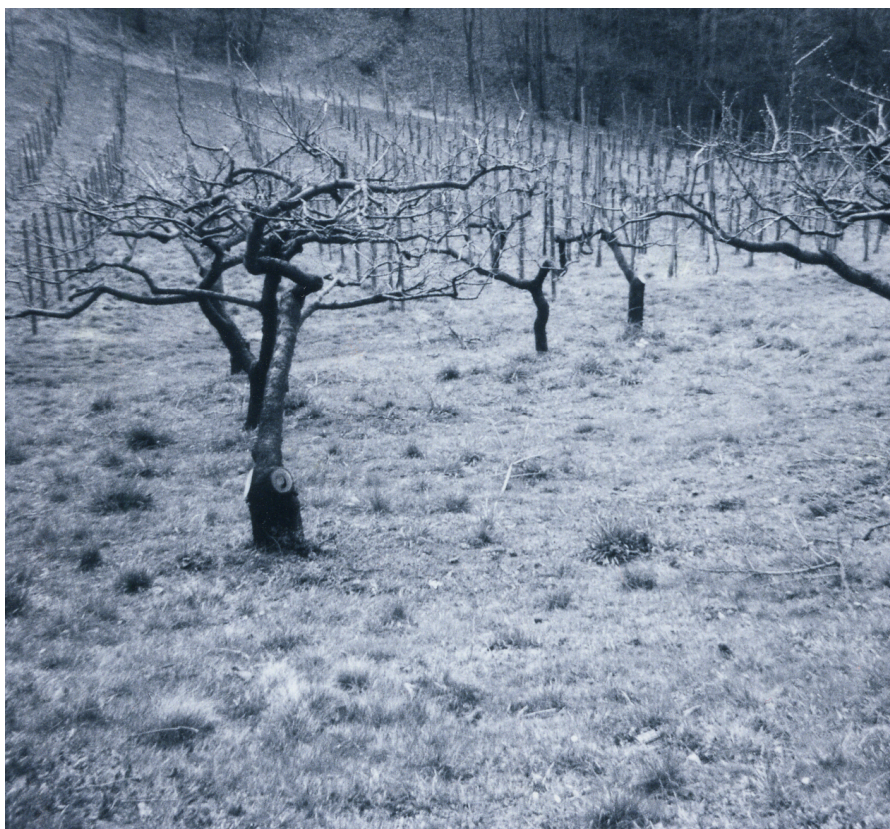
Austria, Silberberg The vineyard of my first winery design