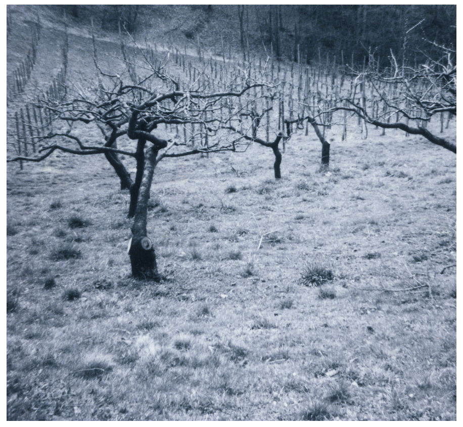
Austria, Silberberg The vineyard of my first winery design