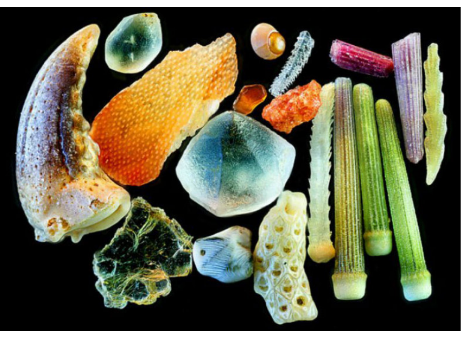
Yanping Wang : Beijing Planetarium: Sand Nikon's Small word, 2010

An architecture which is naturally related to life. This is the common ground of the choosen examples, which results quality at each. This architectural mentality can be also used by designing other type of houses during and after the university studies. The wineries raised their marketing role significantly. Architecture won a new door to contact a much larger audience.